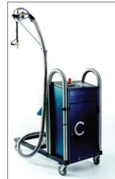
Ciject One Resin Injection Machine