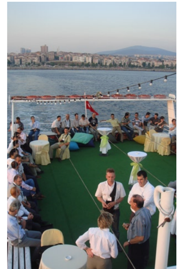
Summit Attendees on a Boat Trip in Istanbul