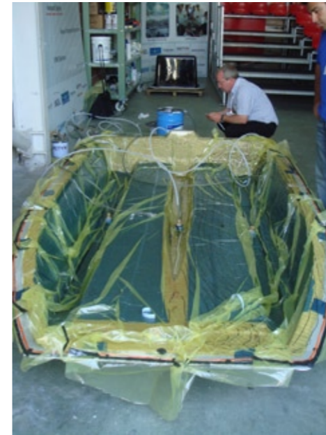
2.4 Meter Catamaran Infusion

Please review the following pages for a full event schedule and presentation abstracts.