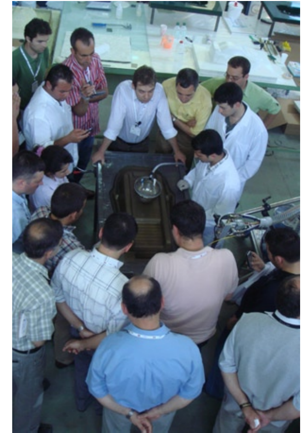
L-RTM Injection Demo