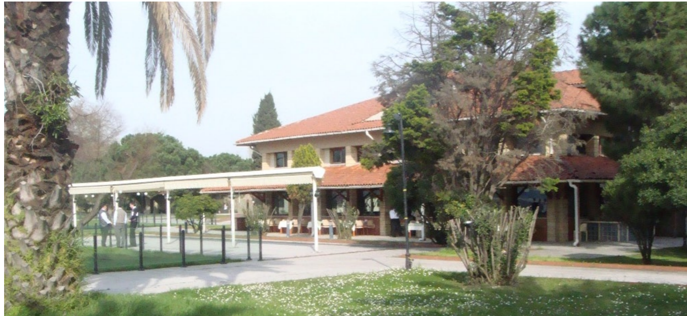
METYX Second Biennial Composites Summit Venue

METYX Composites Biennial Composites Summit was born out of the belief that formal training and hands-on, real world experience is what makes it possible to turn theory and ideas into successful, inventive end products. Today the Composites Summit is the most comprehensive event for high-performance composites in Turkey and amasses industry leaders from across the globe.