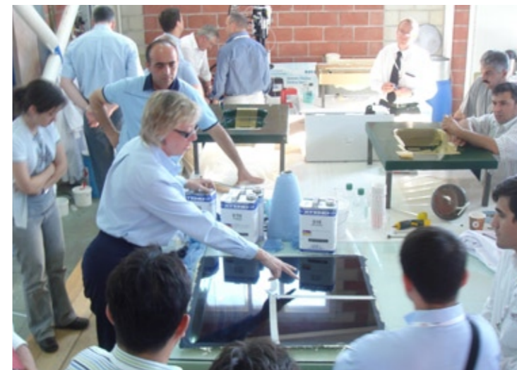
Axel Mold Release Application