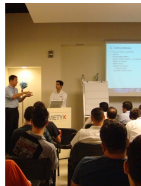
METYX Composites RTM Training - 2008