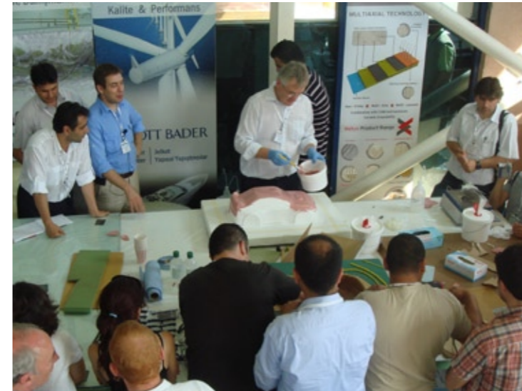
Application of Moldguard